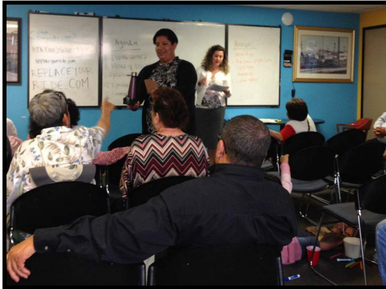
Figure 3: Huntington Park Community Meeting, June 1, 2016

members. A Spanish-speaking staff member took notes to document the discussion. A photo from the Huntington Park meeting is presented in Figure 3.