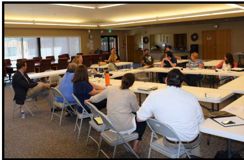
Figure 5: Redwood Valley Roundtable Meeting, August 31, 2016

Additional Community Recommendations to Increase Clean Transportation Access Residents provided the following additional input on the community’s transportation challenges: