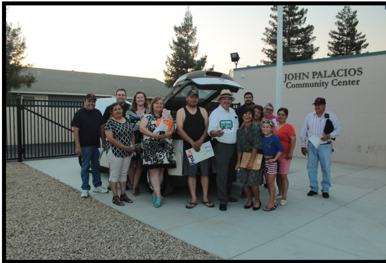
Figure 4: Huron Community Meeting, August 11, 2016