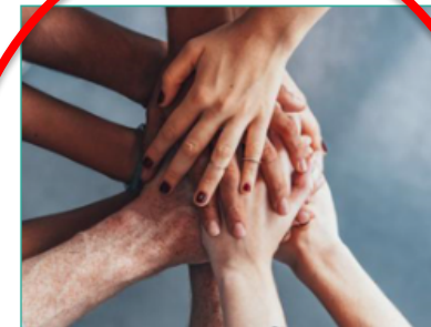
Community Air Protection Program Resource Center