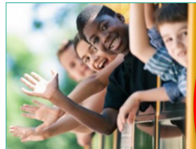
Final Community Air Protection Blueprint