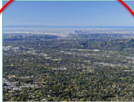
Emission Reduction Strategies