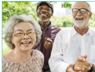
2018 Community Recommendations Staff Report