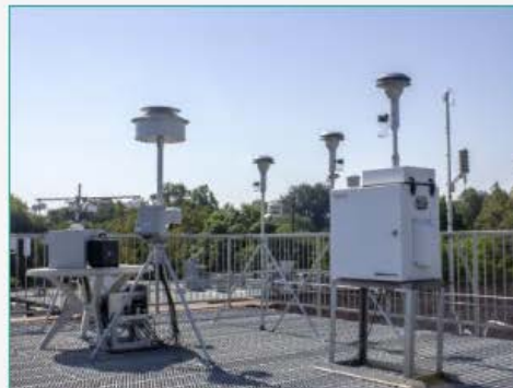
Community Air Monitoring