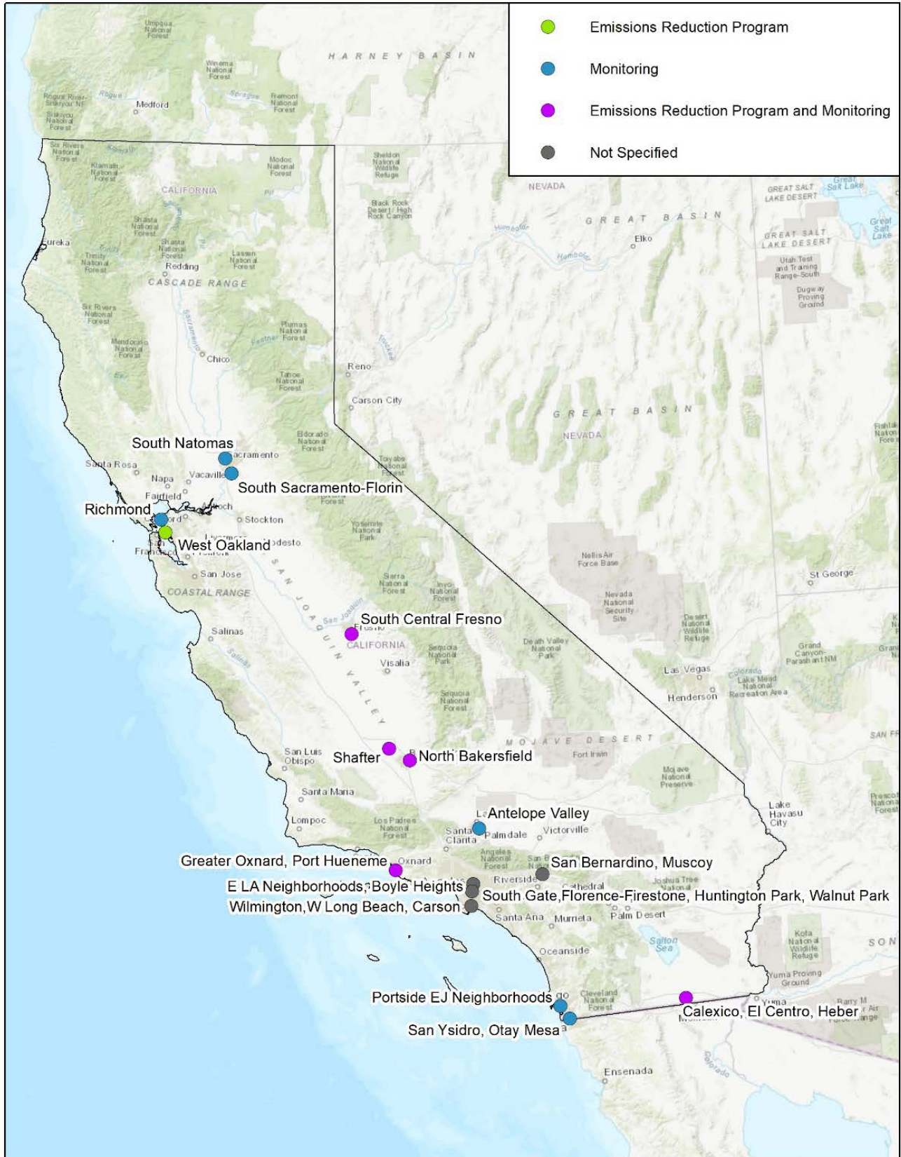
Figure A - 3. Final Air District Recommendations