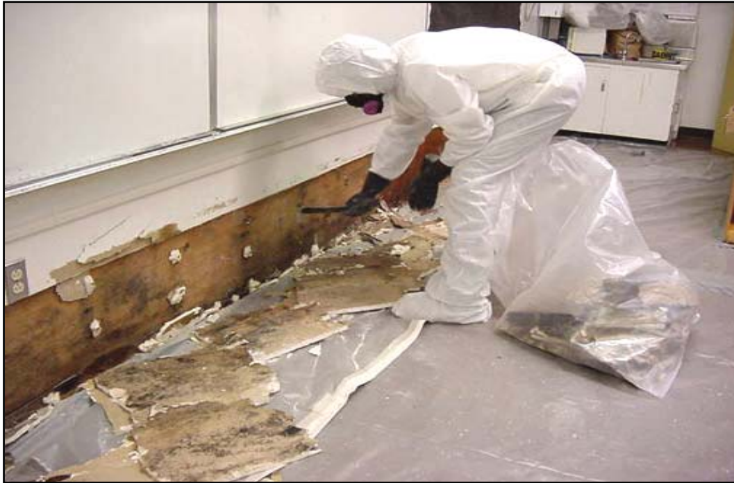
Mold contamination in wall interiors requires thorough remediation.