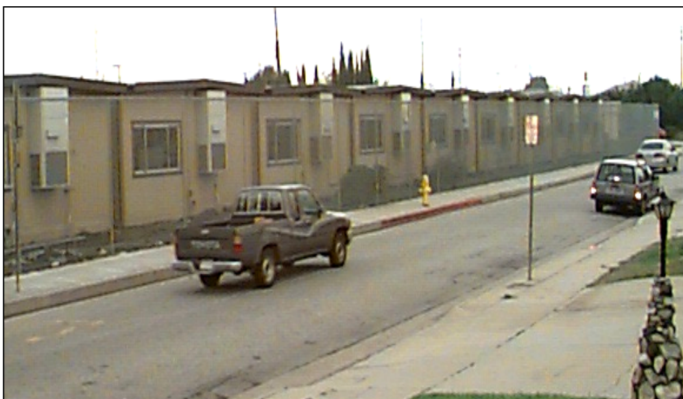
Vehicle traffic near air intakes of classrooms can be a major source of small particles, volatile organic compounds, and other pollutants.

One possible explanation for the increased fine particle counts is that portables may be closer to vehicle traffic and other outdoor particle sources. In this study, over 50% of portable and traditional classrooms were located within 50 feet of parking lots and roadways. Portables usually have wall-mounted rather than roof-mounted HVAC units, and are sometimes sited with their air handling units near roadways and parking lots for security reasons, which could lead to increased particle infiltration into those rooms. Recent research (Sioutas et al. , 2003) has shown dramatically higher levels of fine particles very near roadways. Other likely sources of particles (and VOCs and other pollutants) include portable equipment such as leaf blowers and lawn mowers used for landscape maintenance. In addition, carpets and rugs were found more often in the portable classrooms, and could be a source of the particles, either due to resuspension of previously deposited particles or chemical reactions at the carpet surface that produce fine aerosols (Fan et al. , 2003). Further analysis is needed to confirm the relationships of potential indoor and outdoor particle sources, and to examine the particle count patterns throughout the day.