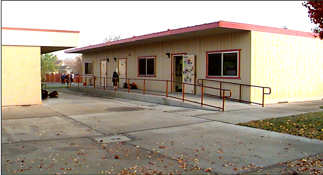
Typical portable (relocatable) classrooms.

2001 school year were portable classrooms. It is estimated that about 80,000 to 85,000 are currently in use as classrooms in California.