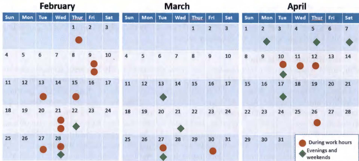
Fig. 1 – Meetings held and attended by SCAQMD staff where AB 617 was discussed (February – April 2018)

A dedicated website was created to provide information on AB 617 events and updates ( www.aqmd.gov/AB617 ). This website included a PDF form, which could be filled in online, and a web form for community members to submit their input and self-recommendations. As of April 20, 2018, SCAQMD staff has received a total of 55 community self-recommendations and will consider all submissions through May 7, 2018 for inclusion in the Year 1 prioritization effort.