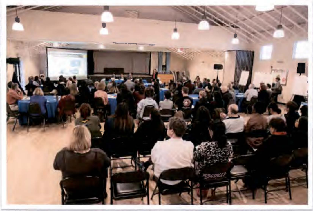
A7: Photographs from AB 617 community meetings hosted by SCAQMD