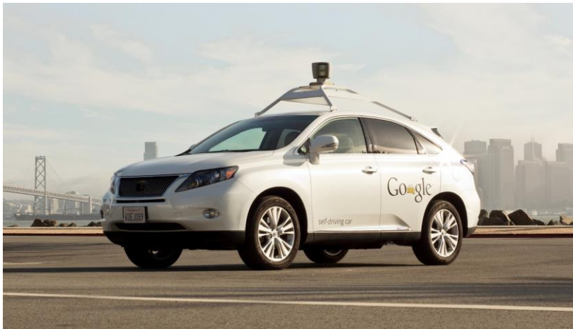
Exhibit 2: Google Driverless Car

Level 4 vehicles would require no human driver for operation and indeed could operate without any occupants. Networks of shared, taxi-like AVs with intermediate trips by unoccupied vehicles would require AVs of Level 4 capability. As of 2014, no Level 4 vehicles exist. Estimates of when they would be developed range from 2025 to 2050. Possible adoption timelines are discussed further in Section 2.