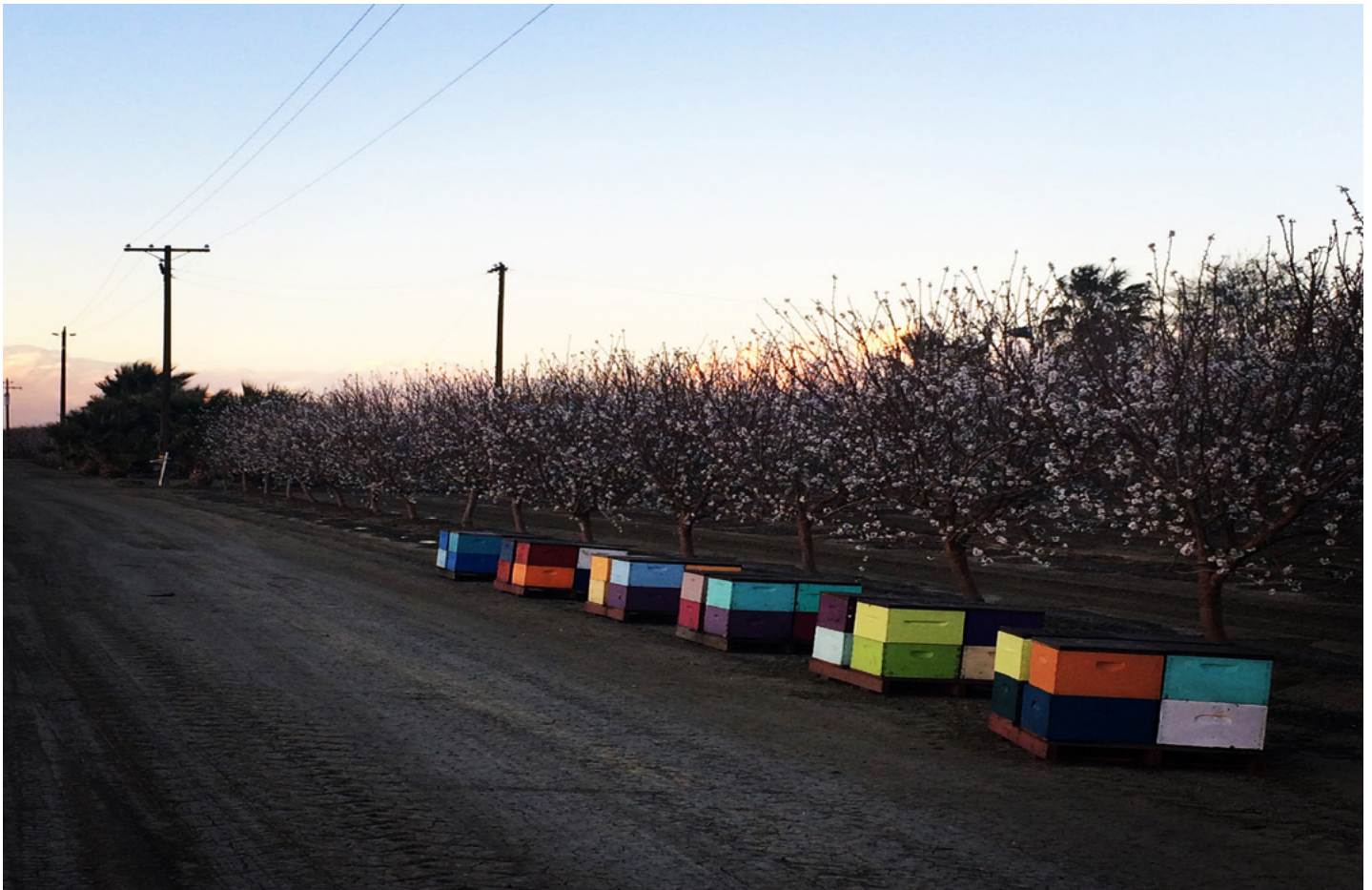
Almond fields in spring near Tranquility, CA